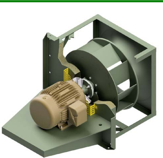
Size 22 Class 2 PLR Insulated Direct Drive Plug Fan with Integral Inlet Cone Assembly