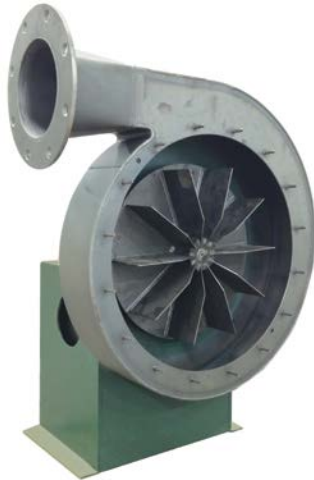
Pressure Blower with motor.

Open style Pressure Blower steel wheel design with SST wheel and housing .